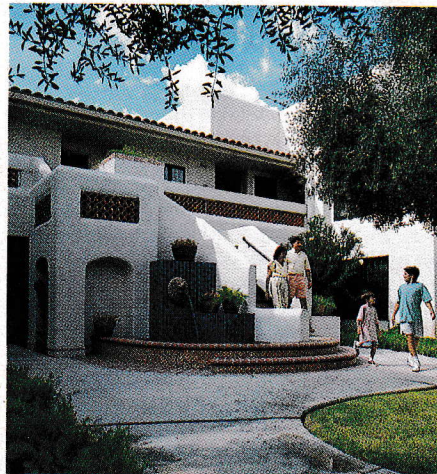
Where most condominiums average well under 1,600 square feet, Harbour Village's four models range from 1,600 to 2,000 square feet.