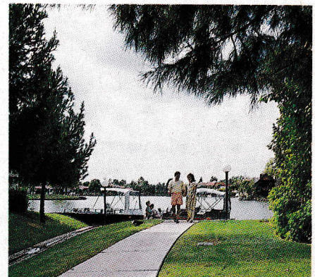
Harbour Village offers you The Lakes as your recreational and psychological backdrop.

"Because of its proximity to the airport, we appeal to business travelers who can jet in and jet out,"